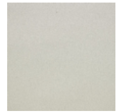
0633-18 WOOLY - DUNE