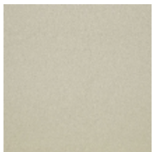
0633-19 WOOLY - SABLE