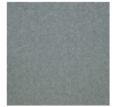
0633-12 WOOLY - CENDRE