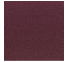
0633-06 WOOLY - FIGUE