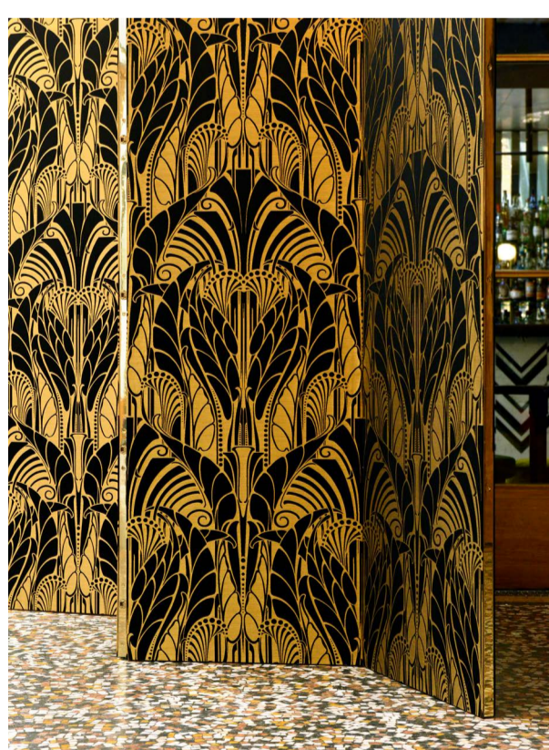
Screen made to measure, Phelippeau Tapisier