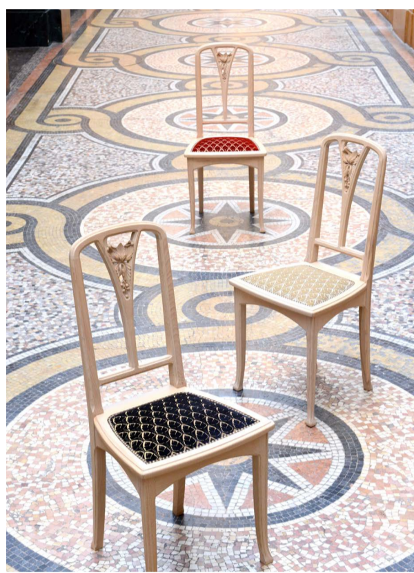
Chairs «Ecole de Nancy», Henryot & Cie