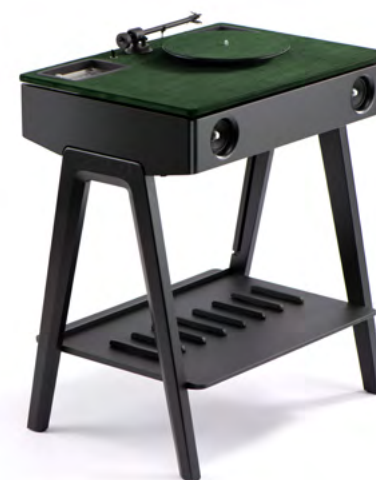
LX Turntable special edition Lelièvre Riga