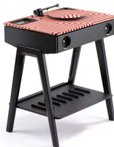
LX Turntable special edition Lelièvre Hera

This desktop-sized speaker can be used for any purpose, whatever your equipment. From bluetooth® to vinyl, combine it with all your sources: tablet, computer, turntable (thanks to the shock absorbers supplied with the speaker), CD player or even an additional wifi system to be integrated into the hatch (Sonos®, Airplay® Airport express®, Google® chromecast audio® ...).